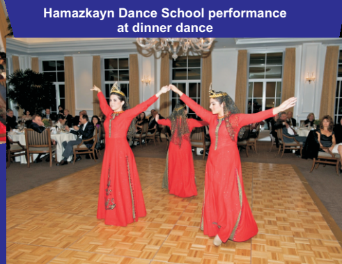
Hamazkayn Dance School performance at dinner dance