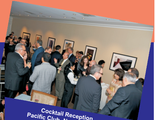
Cocktail Reception Pacific Club, Newport Beach